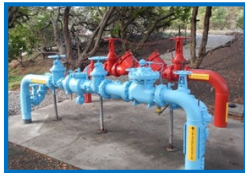
Potable (blue) and fire protection (red) water piping newly coated.