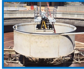
Empty secondary clarifier.

In June, staff diverted primary influent flow to off-line primary clarifiers to allow technicians to work on four aeration basin influent gates and channel piping. Staff also took this opportunity to rotate secondary clarifier tanks. O&M staff worked closely together to successfully prioritize these projects and reduce downtime, focus resources, and limit impacts on operations.