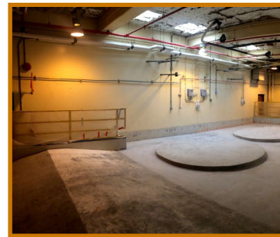
Interior of Chemical Storage Room, showing new concrete floor.

In the hypochlorite chemical storage room, the floor had chloride damage and needed to be replaced. The contractor had to remove and replace damaged concrete and install a new, non-skid epoxy coating. Agency staff designed and built the new room. Over the subsequent months, the contractor poured the new concrete floor and the epoxy coating will be installed and the piping system replaced with assistance from Dee Consulting. Safety barriers will be installed during construction.