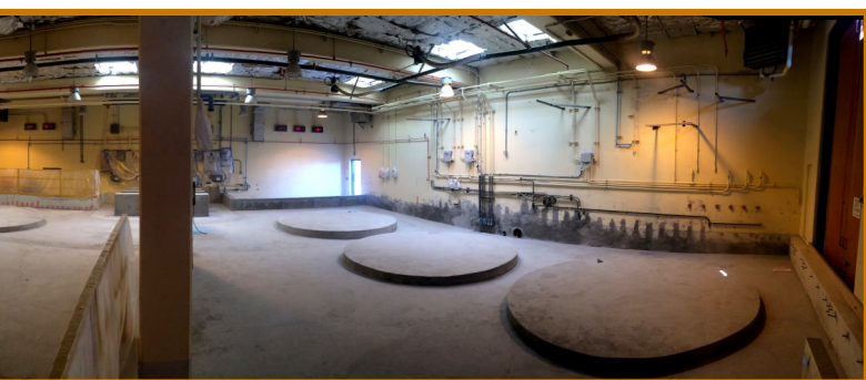
Showing newly poured concrete floor and tank pads.

age room, the floor's epoxy coating and top layer of concrete had to be replaced. The Agency awarded the construction contract to Pacific Infrastructure Corporation (PIC). In May, a temporary hypochlorite pumping system for use during construction, PIC removed the damaged coating and concrete and installed tank pads. After the concrete cures, the new epoxy coating system built. Staff is managing and inspecting the construction project, and Carollo Engineers is providing engineering services