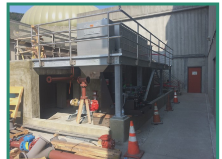
New RDT's being installed.

The Board awarded a construction contract to Mountain Cascade Inc.