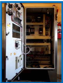
Inside the centrifuge control panel.

One of the three centrifuges used to dewater biosolids needed a control system upgrade. A programmable logic controller (PLC) that automatically controls the equipment operation was no longer supported by the manufacturer. Modern controllers were installed in June.