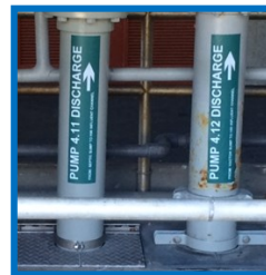
New site sump piping.

The site sump at the Headworks has the taxing job of receiving septage loads from private haulers, RV waste, and wastewater from the Administration and Maintenance buildings. A bypass system was set up to avoid any service interruptions, and vital repairs to the pump equipment was completed.