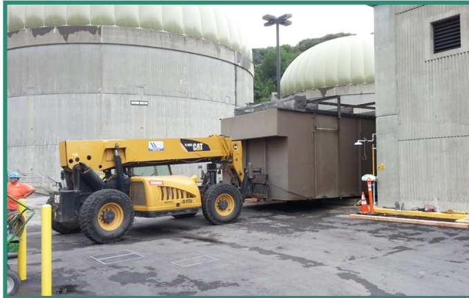
Demolition of the existing DAFs.

(MCI) for the low bid amount of $1,780,250. The DAF demolition will be sequenced, meaning at least one thickener will be in service at all times so the treatment plant can continue normal operation. After the major equipment was procured and delivered, MCI began construction activities by demolishing the first DAF. Most of the mechanical installation for the first RDT has been completed and the electrical/instrumentation work will be finished in early September. The RDT will be tested, and once approved by the Agency, MCI will demolish the second DAF and complete construction of the second RDT.