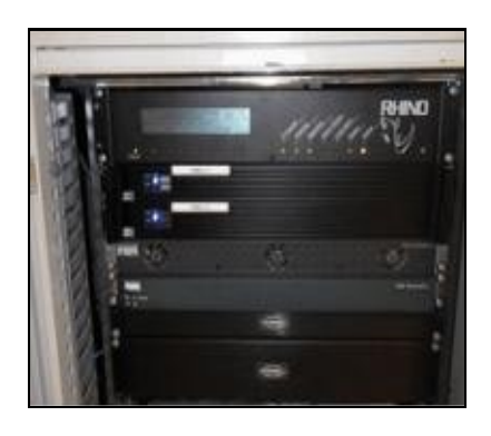
Pictured, the new VoIP system

Why replace our existing system? The Merlin Legend phone system has been a workhorse for CMSA. It was installed in 1993 and has worked reliably, but has been out of production for years with parts and technical support no longer readily available. We installed the new system ourselves, which was significantly less expensive than contracting with a vendor. Benefits realized by switching to digital phones are the business office technology tools available to staff, such as caller id, call waiting, and integrated voice and email. •••