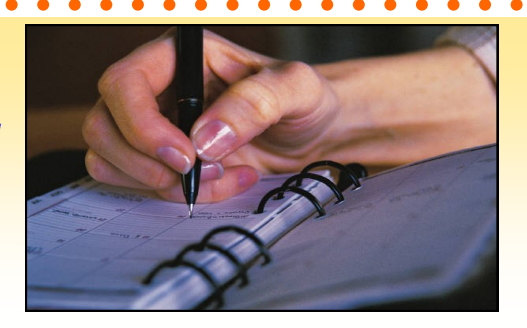
Note: The next Regular Board Meeting will be held on February 8, 2011 at 7pm at the CMSA office.

The design plans and specifications have been completed by Kennedy/Jenks Engineers, and the next step is the adoption of the finalized plans and specifications by the Board and authorization to advertise the contract for bidding. On a parallel track, Environmental Science Associates prepared an addendum to the Mitigated Negative Declaration (MND) developed for the Wet Weather Improvement Project, which the Board adopted at their January 2011 meeting. Bidding is planned to begin in late February, with an award recommendation planned for the April Board meeting. Once the contract is awarded and executed, construction is expected to take 600 calendar days, through the end of calendar year 2012. ◆ ◆ ◆