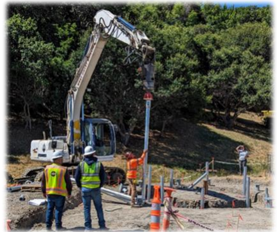
Installation of the helical piles

On-site construction began in late March and the contractor has completed the demolition, site excavation, and installation of the underground conduits and piping. The helical piles were installed for the new tank foundation, the new chillers for the biogas treatment were delivered, and the new tank and recirculation pump are expected to arrive soon. However, due to the long lead time required for the biogas heat exchanger, the project completion date has been pushed to December 2023. This project is funded by CalRecycle's Co-Digestion Grant, and to date CMSA has requested reimbursement for $926,000 of the $2.5 million awarded for construction related activities.