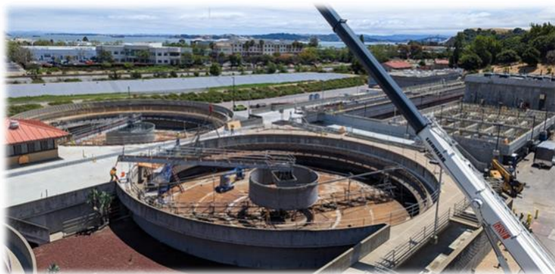
Removal of the walkway bridge in Secondary Clarifier No. 2

Construction is well underway to rehabilitate Secondary Clarifier No. 2 with a new center column and return activated sludge (RAS) pipe, fiberglass grating, walkway bracing, wires and conduits, and new protective coating for its steel and effluent channel concrete surfaces. The rehabilitation of all four secondary clarifiers was a multi-year project sequenced out in separate contracts from 2021 through 2023 to allow construction activities during dry weather and