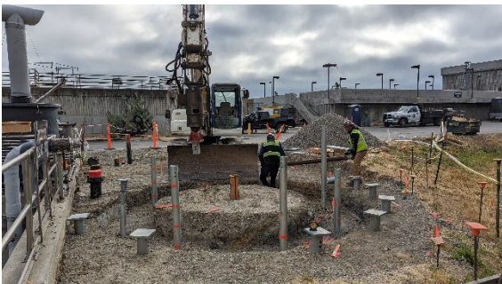
7/10/2023: Helical Piles for tank foundation