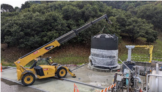
11/29/2023: Installation of new tank