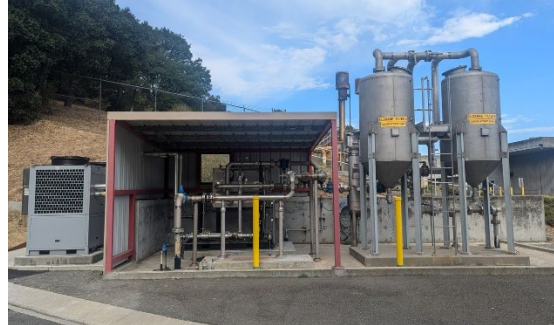
2/13/2025: Upgraded Biogas System