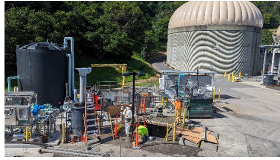
4/16/2024: Construction of widened hatch