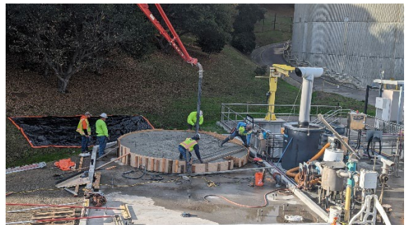
11/21/2023: Forming concrete pad for tank