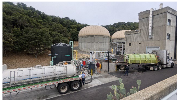
9/20/2024: Use of new tank & widened hatch