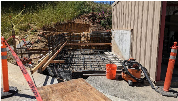
5/11/2023: Biogas Foundation Construction