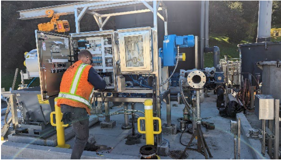
2/6/2024: Electrical connections