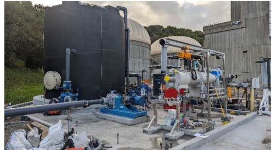
1/3/2024: Installation of pipe/equipment