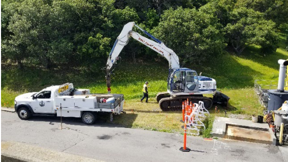
04/21/2023: Geotechnical test pile