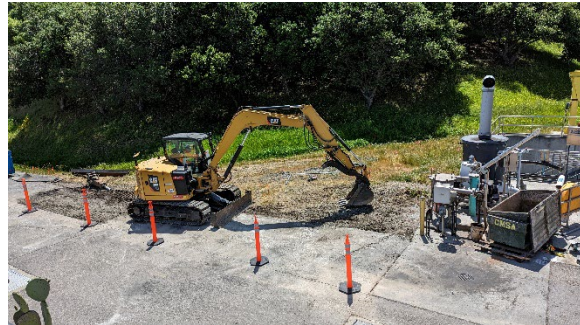
04/25/2023: Site prep for construction