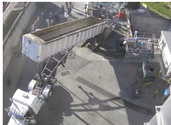
11/6/2024: Republic Services food waste into widened hatch