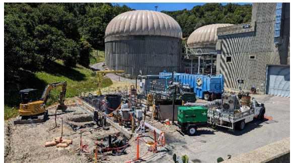
5/15/2023: Excavation for tank/piping