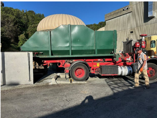
5/31/2024: MSS food waste delivery