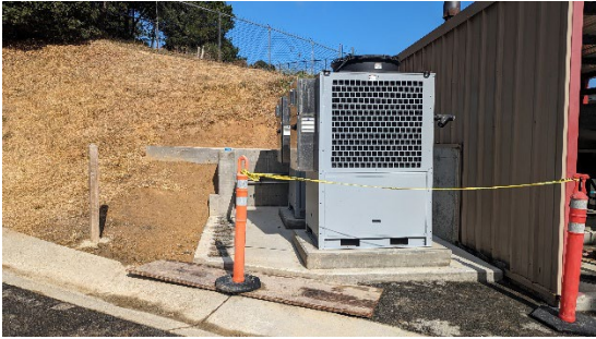
9/14/2023: Installation of chillers