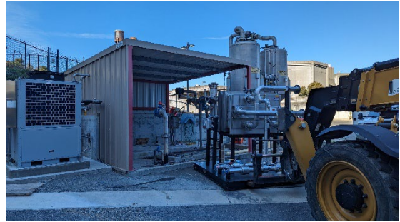
11/27/2023: Installation of heat exchanger