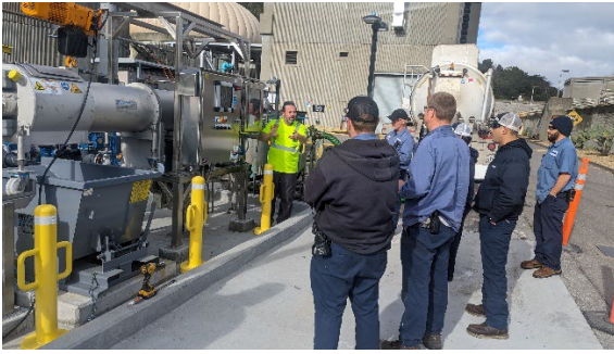
2/13/2024: Equipment Training