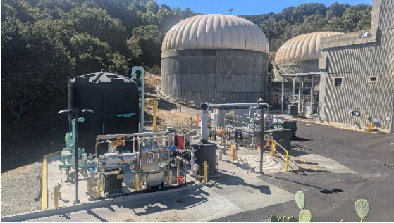
10/3/2024: Upgraded Receiving Station