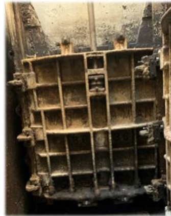
Original installed gate

Staff replaced six sluice gates in the Aeration Basins area this fall. Over the past 10 years, CMSA has been systematically replacing originally installed gates as they reach the end of their working lifespans. This project was challenging, as these gates operate partially submerged, are in a very tight area to work in, and control flow out of the aeration system and into the secondary clarifiers. This required support from several work groups to safely shut down and isolate portions of both systems, while keeping both process areas operational. The original cast iron gates were removed from their frames, and new lightweight stainless-steel gates were installed and then tested for watertightness. Following installation, their actuators were installed and calibrated to ensure that these gates would open and close correctly.