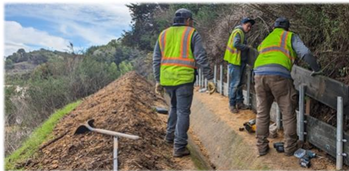
Installation of new retaining wall after clearing v-ditch

In anticipation of wet weather, staff cleared debris from the lower v-ditches on the Andersen Drive hillside and contracted with Forster & Kroeger to perform maintenance of the upper v-ditch, which was extensively overgrown with brush and was packed with soil that prevented proper drainage. Upon clearing the v-ditch, several areas were identified to be susceptible to future slides and therefore additional segments of short retaining walls