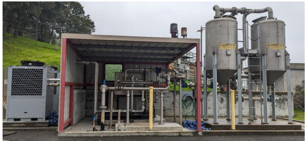
New chillers and heat exchanger for biogas treatment system in service

Remaining work includes making the final connections and startup of the new equipment at the organic waste receiving tank site. The new tank, ladder, seismic anchors, piping, lighting, mixing pump, and screening system have been installed. The proposed receiving station hatch widening work will be incorporated into this project, and completion is anticipated for spring 2024. This project is funded by CalRecycle's Co-Digestion Grant, and to date we have received reimbursement for $1.73 million of the $2.5 million awarded for the project costs, including associated CMSA staff time.