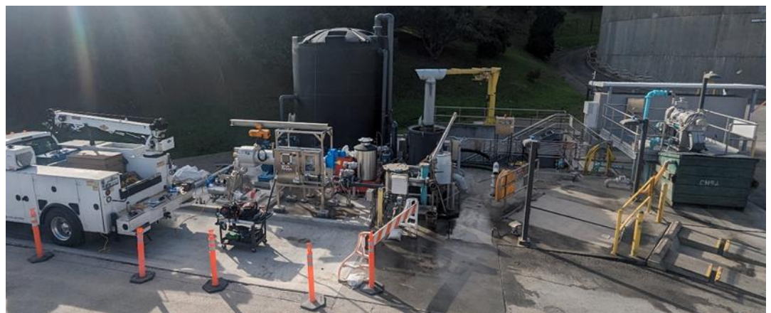
Construction at the new organic waste receiving tank near completion