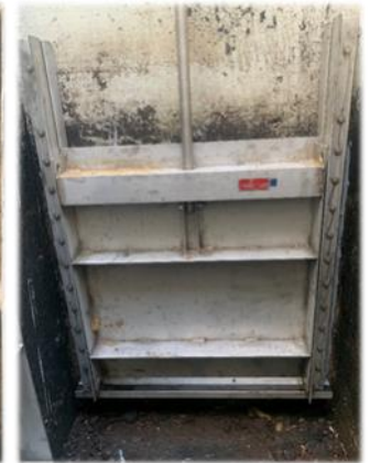
New replacement gate